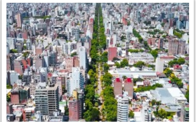
The City of Rosario