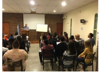
English Classes in Bible Baptist Temple.

Each month we have at least one special event planned on a Friday focusing either on men, women, or couples. In the month of April we had a couples meeting, where I taught on being open and united in our marriages. Next month we will have our first ladies' retreat on the 19th and 20th of May. The ladies will spend that Friday and Saturday at our camp, studying God's word and enjoying fellowship.