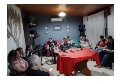
First Meeting in Pergamino