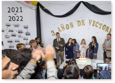
Our church celebrated it's three year anniversary.